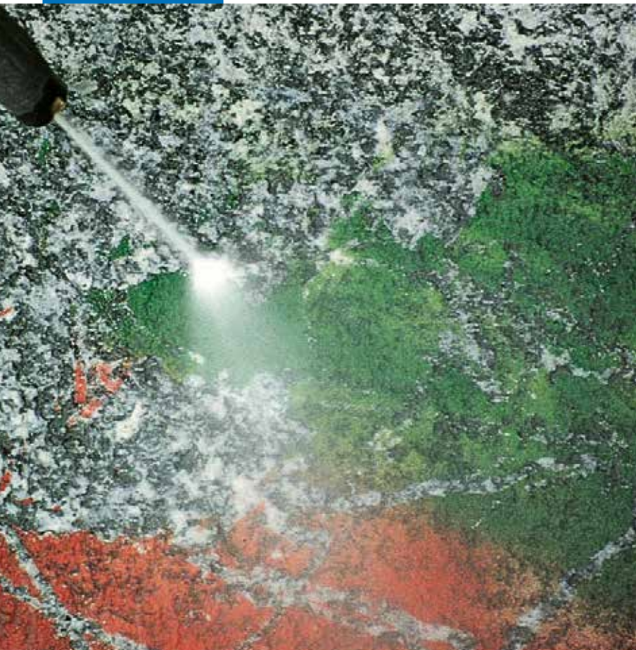
Using a high-pressure cleaner on granite treated with WallGard Graffiti Barrier