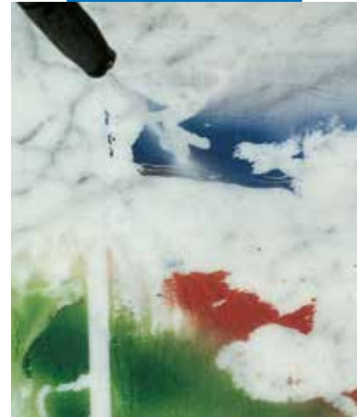
Using a high-pressure cleaner on Carrara marble treated with WallGuard Graffiti Barrier