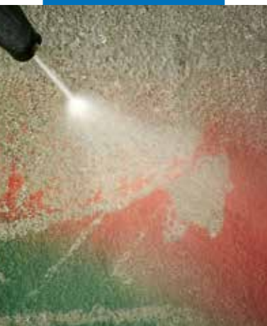
Using high-pressure cleaner on concrete treated with WallGard Graffiti Barrier

Note: Graffiti should be removed from surfaces treated with WallGard Graffiti Barrier by using a high pressure cleaner with water at +80°C. We recommend verifying beforehand that the substrate can withstand the physico-mechanical stress.